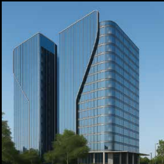
Phoenix Business Hub

With landmark collaborations across India's top developments, South Glass continues to shape the skyline with precision and trust.