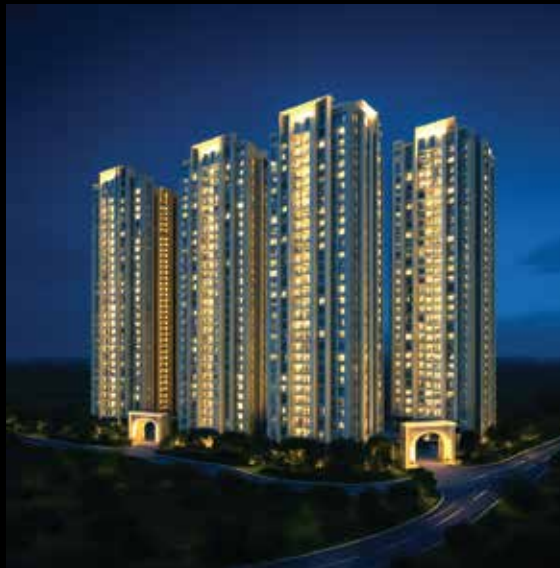
Kohinoor by Auro Realty